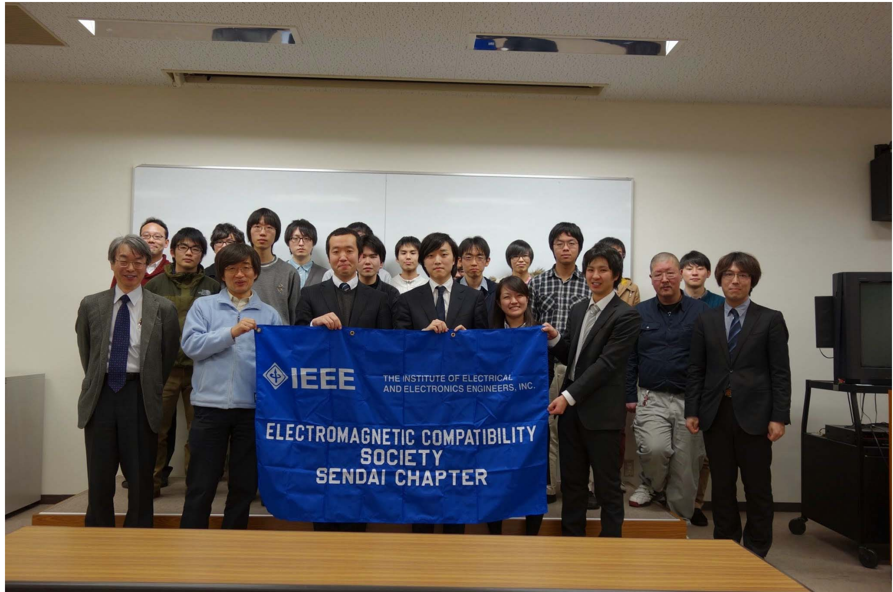
Regional Chapter Meeting