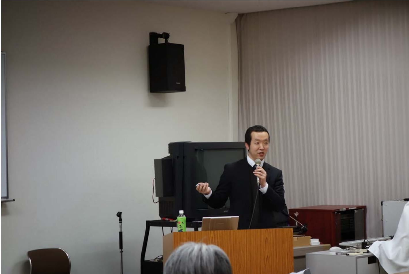
Regional Chapter Meeting